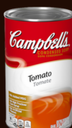
Tomato #471234, 12/50 oz