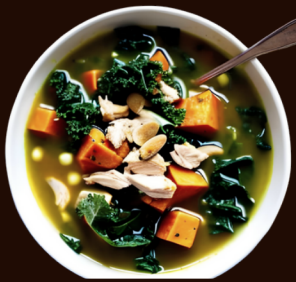
Chicken & Kale with Sweet Potato #400740, 4/4 lb Gluten Free