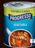
Vegetable Soup #471201, 12/19 oz