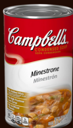
Minestrone #471231, 12/50 oz