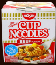
Cup of Noodles, Beef #900368, 12/2.5 oz