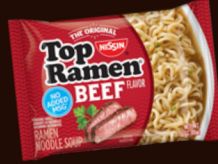
Top Ramen Beef #471280, 24/3 oz