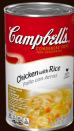
Chicken with Rice #471241, 12/50 oz