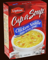
Cup-a-Soup Chicken Noodle #451244, 24/3 oz