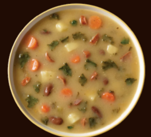
Turkey Sausage & Kale #400721, 4/4 lb Gluten Free