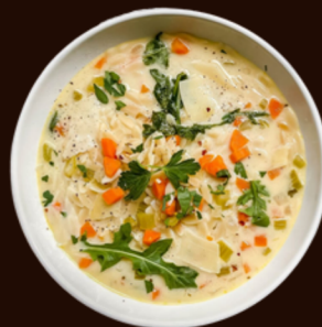
Chicken Lemon & Orzo #400826, 4/4 lb ABF, Low Fat