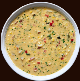
Corn Chowder Southwest #400751, 4/4 lb