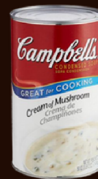
Cream of Mushroom #471237, 12/50 oz