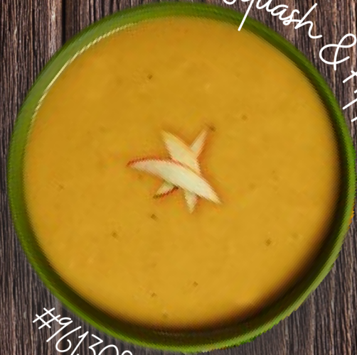
Butternut Squash & Apple