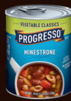
Minestrone Soup #63545, 12/19 oz