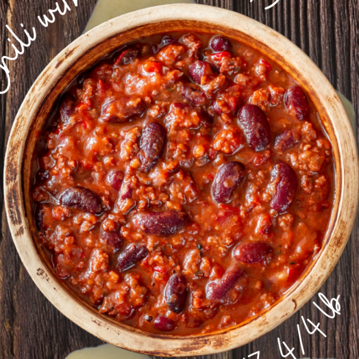
Beef Chili with Beans (GTF)