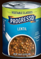
Lentil Soup #471212, 12/19 oz