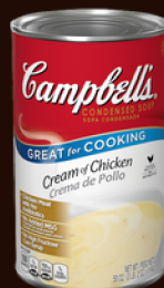
Cream of Chicken #471235, 12/50 oz