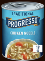
Chicken Noodle Soup #471211, 12/19 oz