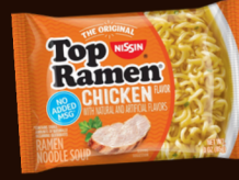
Top Ramen Chicken #471285, 24/3 oz