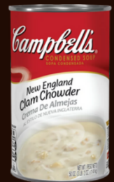
New England Clam Chowder #471238, 12/50 oz