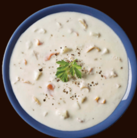
New England Clam Chowder #400722, 4/4 lb Gluten Free