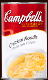
Chicken Noodle #471243, 12/50 oz