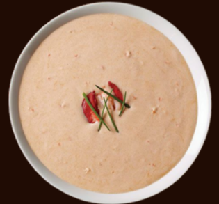
Maine Lobster Bisque #400716, 4/4 lb