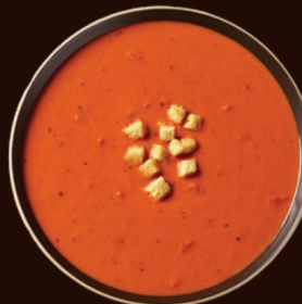
Creamy Tomato #400719, 4/4 lb Gluten Free