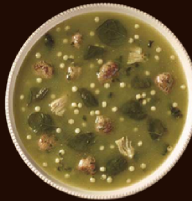
Italian Wedding Meatball #400749, 4/4 lb