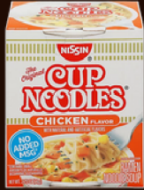
Cup of Noodles, Chicken #900357, 24/2.5 oz