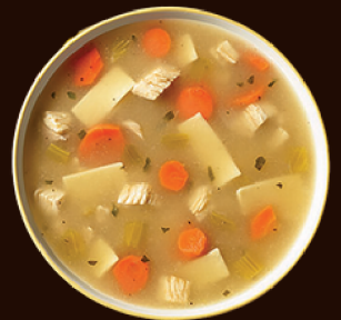
Chicken Noodle #400717, 4/4 lb