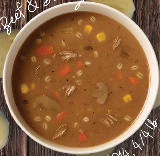
Beef & Barley