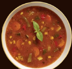
Minestrone #700742, 4/4 lb Vegetarian, Low Fat, Dairy Free