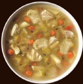
Chicken & Dumpling #400760, 4/4 lb ABF