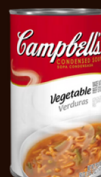
Vegetable #682757, 12/50 oz