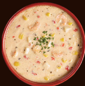
Shrimp & Roast Corn Chowder #400715, 4/4 lb