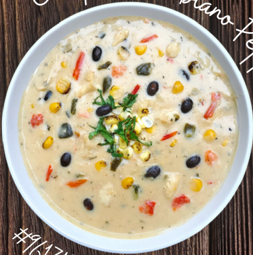
Chicken & Poblano Pepper